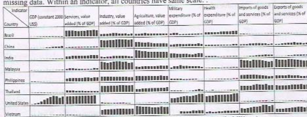
Table given below contains data of GDP in constant 2000 US Dollar (in billions).

The exhibit given below compares the countries (first column) on different economic indicators (first row), from 2000-2010. A bar represents data for one year and a missing bar indicates missing data. Within an indicator, all countries have same scale.